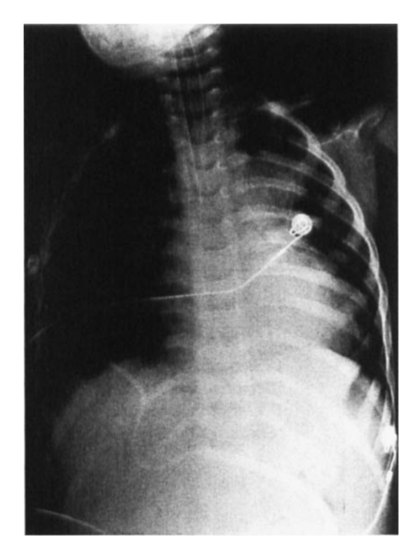
Figure 1. Frontal chest radiograph demonstrates moderate cardiomegaly, an abnormal superior mediastinal contour with focal ill-defined rounded opacity projecting at the level of the aortopulmonary window.

(left atrial to descending thoracic aorta). A large dumbbell-shaped pseudoaneurysm was found eroding into the mediastinum and left pleural space and taking origin from two distinct sites of rupture just distal to the coarctation site. A total of 5 cm of aorta was involved in this inflammatory process, beginning at the base of the left subclavian artery. There was evidence of dissection in the wall of the aorta just distal to the coarctation with compression of the true aortic lumen by the pseudoaneurysm. Proximal and distal vascular control was obtained, the aorta was transected in areas of normal tissue, the mediastinal portion of the pseudoaneurysm was left in situ, and continuity was restored with a 12-mm Hemashield interposition graft.